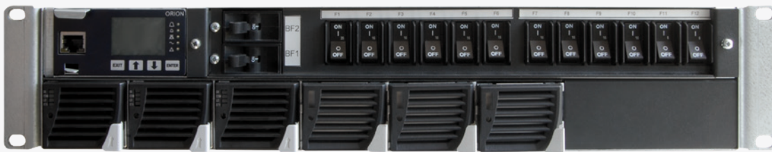
Front view DC ST802