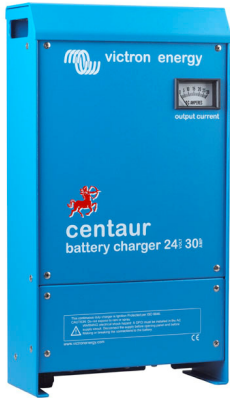
Centaur Battery Charger 24/ 30i